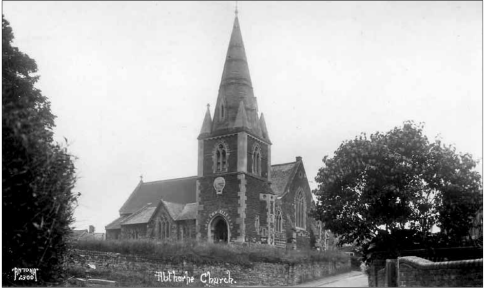
Two photographs of the church and village green showing how it has not always been surrounded by trees.