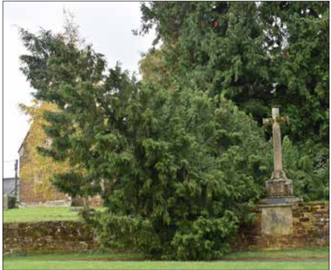
The fallen tress which almost caught the War Memorial.

Jill Tolson unearthed the old photographs opposite to show how the churchyard has an ever-changing landscape as trees are planted, grow and... fall